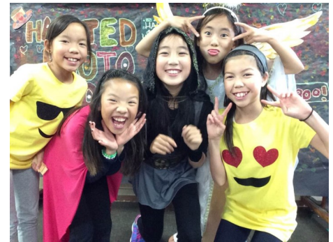
The designers of the Photo Booth tested it out.