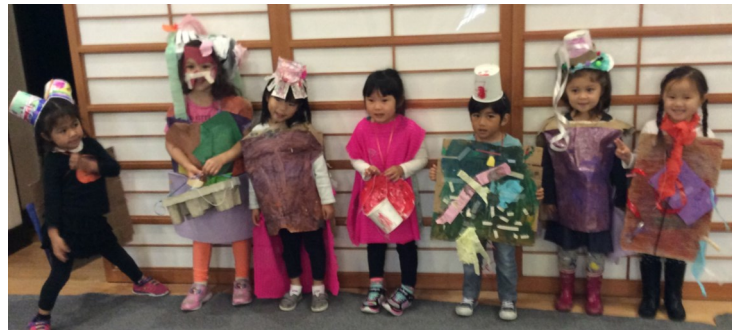
Sutter preschoolers wearing their own costume creations!