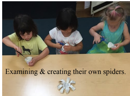
Examining & creating their own spiders.