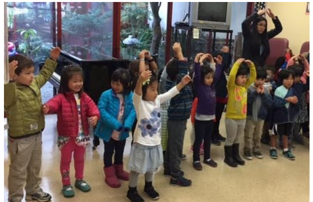
The Bush preschoolers performed a few songs for the Seniors at the Kimochi Home for Keiro no Hi (respect Seniors Day).