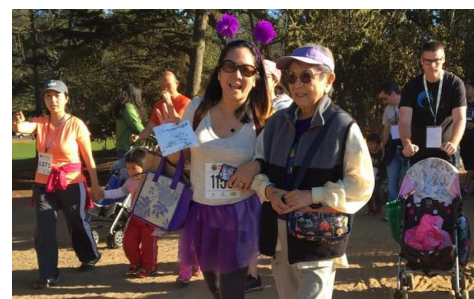
5K Fun for all ages!