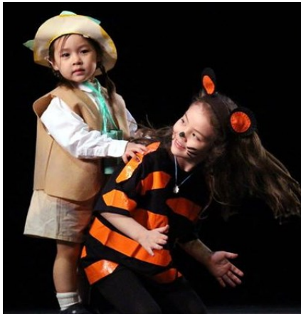
Preschool performers at last year's annual Dowa no Omatsuri performance in February.

Sunday, February 26, 2017 12:00pm –4:00pm Palace of Fine Arts Theatre