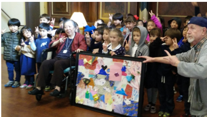
ASP children performed a few songs at Kokoro Assisted Living and presented an art piece to them.