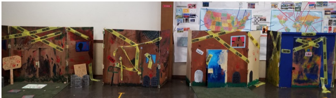
"ASP Avenue" for trick or treating.