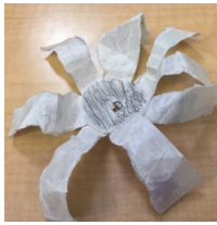
The paper cup “spider”

The Sutter site preschoolers go to the After School Program often to play outdoors due to the construction of the new building addition. One day, Anar found a paper cup that was used for snack on the ground. It was flipped over and torn in several places. He claimed it was a “spider” and said,